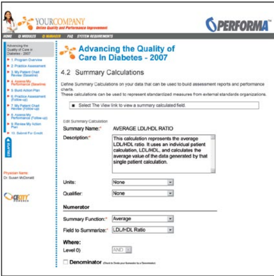
Administrator View Easy to Use Online Content Management System